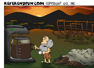
NOAH PREPARES FOR ANOTHER HUGE DAY