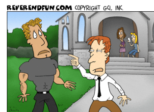
IF WHAT THE LADIES ARE SAYING ABOUT YOU BEING A GREEK GOD IS TRUE, I'M REPORTING YOU TO THE CHURCH OFFICIALS